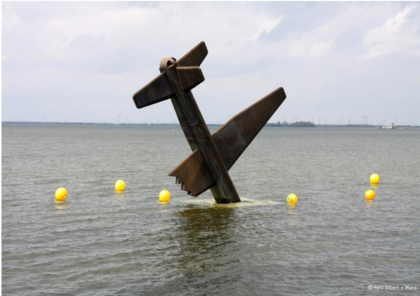
A monument to remember the crews who perished when their planes crashed into the IJsselmeer during WWII

In the Netherlands and the United Kingdom there are a lot of monuments to remember unknown soldiers. Every city or Army Unit has got such a monument.....and that is very good!